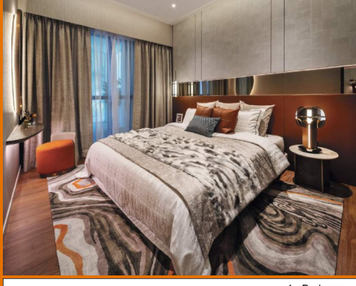
4 - Bedroom